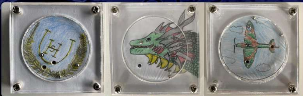
Year 5 and 6 transition days showed an amazing talent coming through in our prospective students.