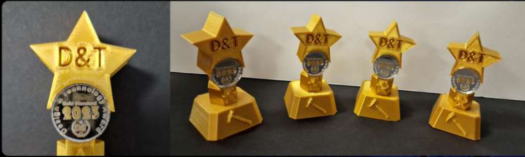
KS3 3D printed trophies ready for D&T awards.

Year 9 have worked well, with some amazing accomplishments in food technology. Year 9 D&T have been producing sustainable bluetooth speakers and interior design models.