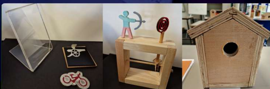
We've had bird nesting boxes, photo frames, pewter cast keyrings and automata mechanisms.